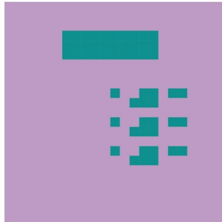
The Catukal Code - IX