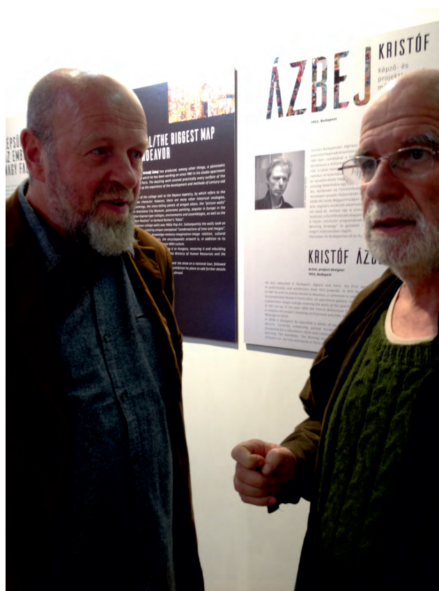
Visitors of the installation „Musée X-Point Zéro” at Art Market Budapest 2016, in Budapest, Hungary