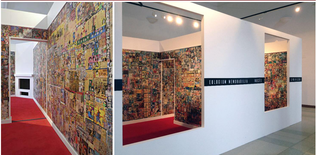
Installation view at Műcsarnok - Kunsthalle Budapest, 2016.