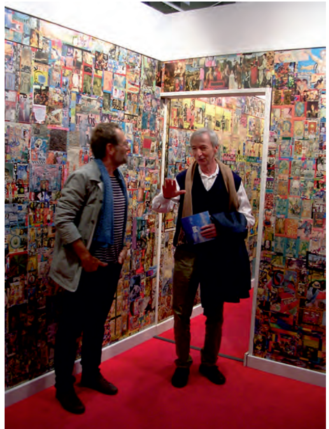
Visitors inside the installation „Musée X-Point Zéro” at Art Market Budapest 2016, in Budapest, Hungary